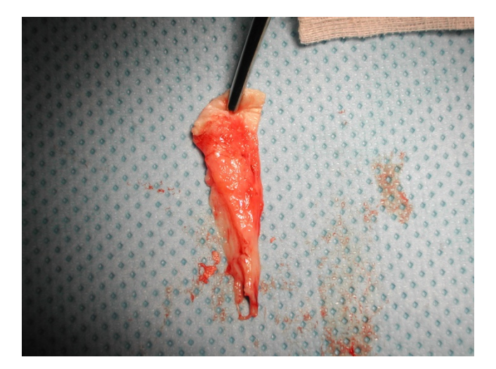
Figure 2 A clinical photograph showing the excised anterior capsule.

Post-operatively the limb was immobilised overnight in maximum extension using a plaster slab. The drain was removed and the cast replaced by a static, extension thermoplastic splint the next day. All patients were discharged on the first post-operative day. No prophylaxis was given to prevent heterotopic bone formation. The splint was worn continuously for two weeks and then at night for six