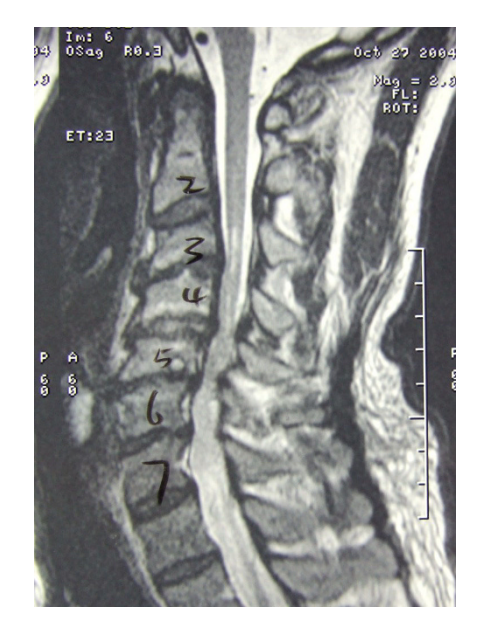
Figure 3 High-signal intensity area in the C3/4 segment in T2weighted MRI image.

Majority of our patients present with dysesthesia (17/18) and had neurologic deficit involving the C5 segment (17/18). We showed compression at the C3/4 level is strongly associated with the development of palsy. Since anatomi-