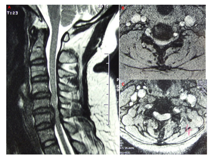
Figure 2 Preoperative MRI image showing compression of the cervical cord at C5/6. A, sagittal T2-weighted MRI image. B, corresponding axial T2-weighted MRI image showing deformation of the C5/6 by the compression. C, no deformation of the cord at C4/5.

Since our patients were all suffering from symptomatic cervical myeloradiculopathy, the distribution of Average Pavlov ratio is expected to be skewed instead of normal, which justified the transformation of the Average Pavlov ratio into a categorical variable. We used the 1<sup>st</sup> quartile as the cut off for defining extremely narrow spinal canal, for subsequent analyses (Figure 5). We are able to show a significantly higher risk of developing postoperative palsy in patients having an Average Pavlov ratio of less then 0.65 with an odds ratio of 3.68. Moreover, there was a higher rate of post operative upper limb palsy in patient with 3 or more compression on preoperative MRI with marginal statistical significance. These results support our assump-