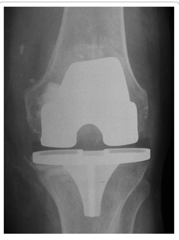
Figure 6 AP radiograph of the knee demonstrating the area of calcium phosphate bone cementage in the medial femoral and medial tibial condyles.

One can argue that the cyst debridements should have been performed in conjunction with a further total synovectomy and tibial polyethylene spacer exchange, in order to remove any residual particulate material and the wear particle generator [8]. Indeed modular polyethylene exchange is a reasonable option when dealing with polyethylene wear and osteolysis in patients with well-fixed knee components [12,13], without evidence of accelerated wear or severe delamination [10], and has similar short-term results and failure rates when compared with patients having full revisions of all the knee components [8]. However, our patient had an arthroscopic synovectomy almost 4 years earlier during which no visible polyethylene delamination or macroscopic wear was seen, and successive knee radiographs had not shown progres-