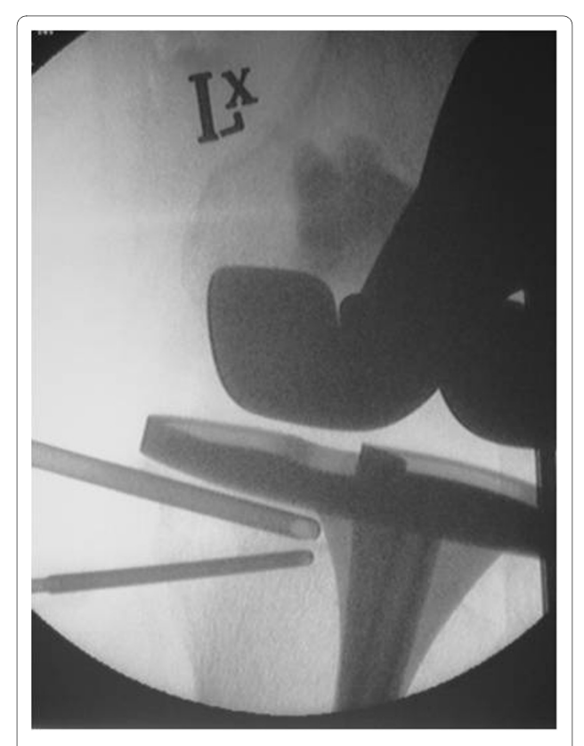
Figure 3 Fluoroscopic image of the left knee showing the introducing cannula and simultaneous venting of the medial tibial condylar cyst.