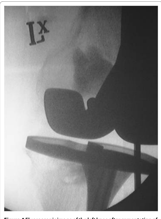
Figure 4 Fluoroscopic image of the left knee after cementation of the medial femoral and medial tibial condyles.

simultaneous venting to allow for free inflow of the material (Figures 3 and 4). After 8 minutes the calcium phosphate had set, and the wounds were closed routinely without drains. There were no wound complications, or blood chemistry derangements, and the patient was allowed to fully weight-bear post-operatively. Histopathology and microbiology of the cyst material confirmed polyethylene granulomata, without any evidence of infection. At 6 week review the patient's knee pain had resolved, and he was able to comfortably fully weightbear. The graft material showed some signs of incorporation on x-ray by 4 months (Figures 5 and 6), and the patient remains well at their 12 month review. KSS at most recent view was 76, WOMAC score 81.7 and Oxford Knee score 21. The patient will continue to have regular clinical and radiological implant surveillance.