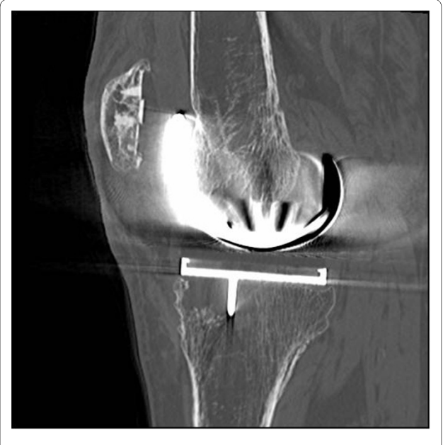
Figure 2 Sagittal CT demonstrating the lytic area in the anteromedial aspect of the tibia.