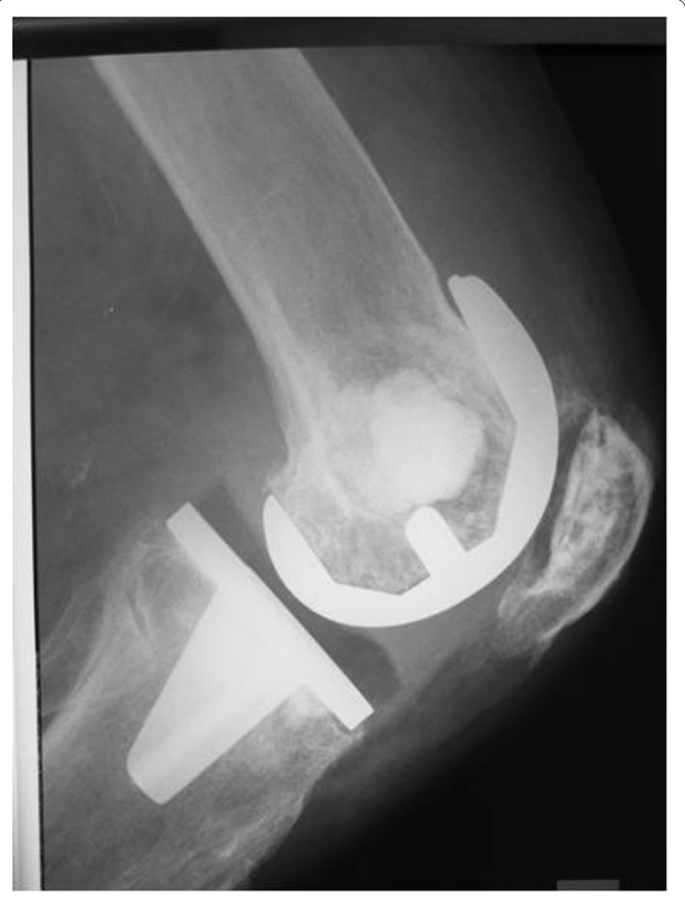
Figure 5 Lateral radiograph of the knee demonstrating the area of calcium phosphate bone cementage in the medial femoral and medial tibial condyles.

grafting in 2000, following severe polyethylene delamination, osteolysis and component loosening. However, treatment decisions are also very much dependent on non-joint patient factors, such as the patient's clinical status and physiological age, comorbidities, and activity levels [8-11], and our patient was deemed no longer medically fit to undergo any kind of extensive or invasive surgery. He thus underwent minimally invasive cyst debridement and grafting alone.