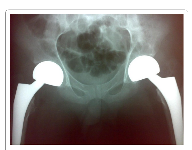
Figure 4 Radiograph taken after operation demonstrates replacement of left and right hip with bipolar prosthesis.