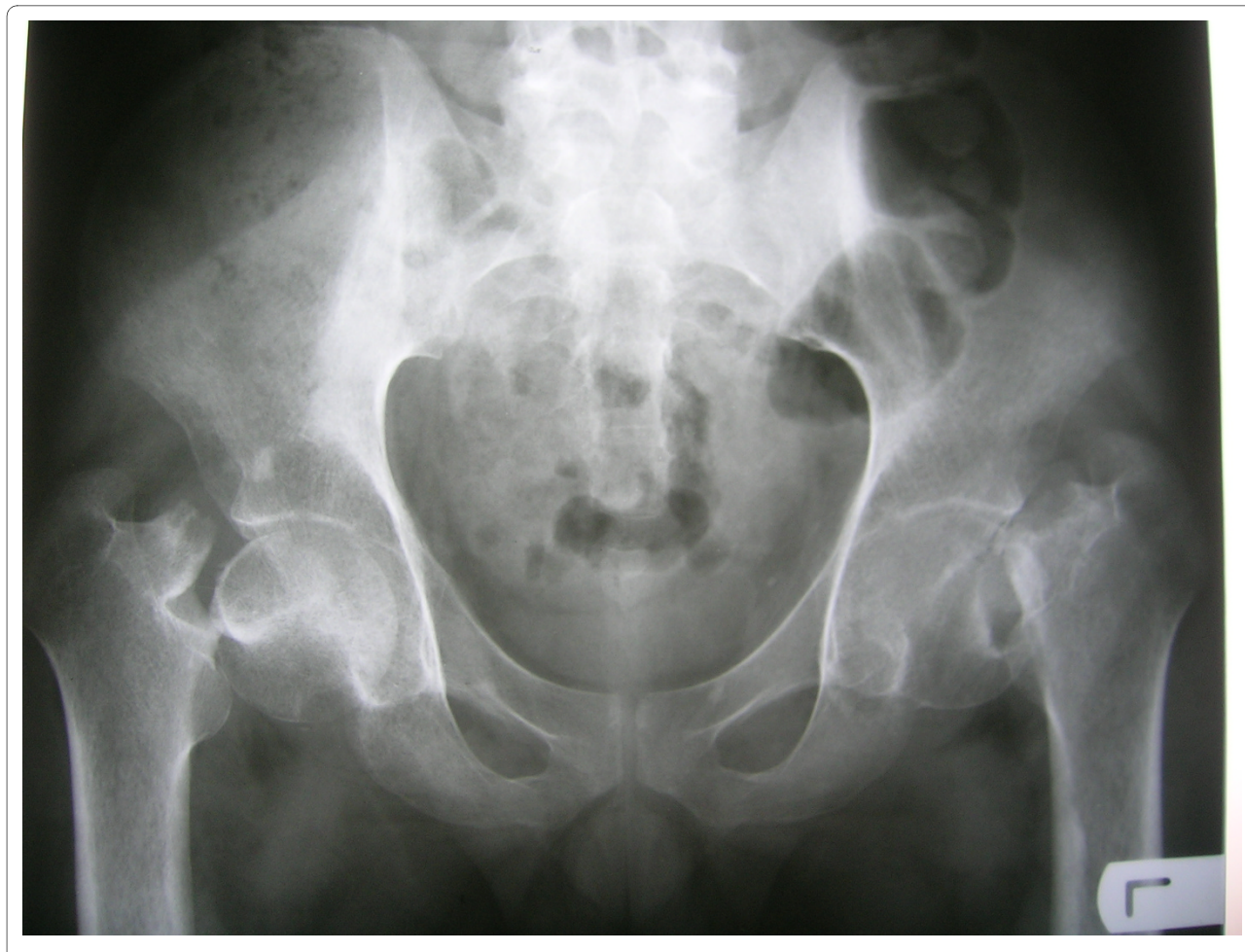
Figure 2 Radiograph taken before operation demonstrates displaced bilateral femoral neck stress fractures.