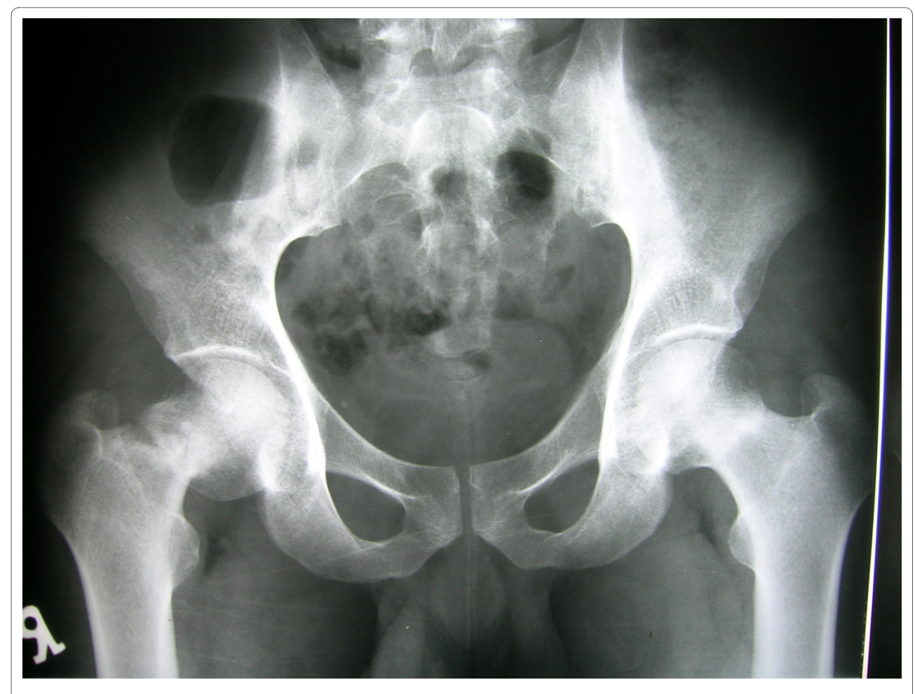
Figure 1 Radiograph taken 4 months before operation demonstrates displaced left femoral neck stress fracture and non-displaced right femoral neck stress fracture.

No limb-length discrepancy was observed because of symmetrical nature of the deformity.