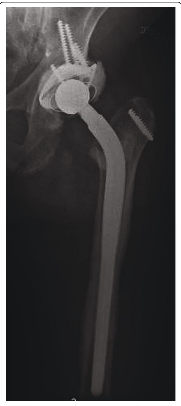
Figure 4 Hip reconstruction with a metallic reinforcement ring and a conical cementless stem, without acetabular bone loss. Cancellous bone allograft was used in the femoral side.

No complications were reported in the perioperative course and during the hospitalization period.