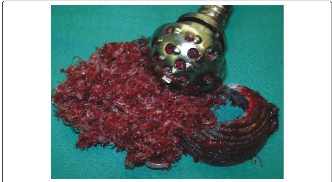
Figure 3 When the polyethylene layer was thin enough, the remaining cup was removed easily by hand tools and bone stock is preserved.