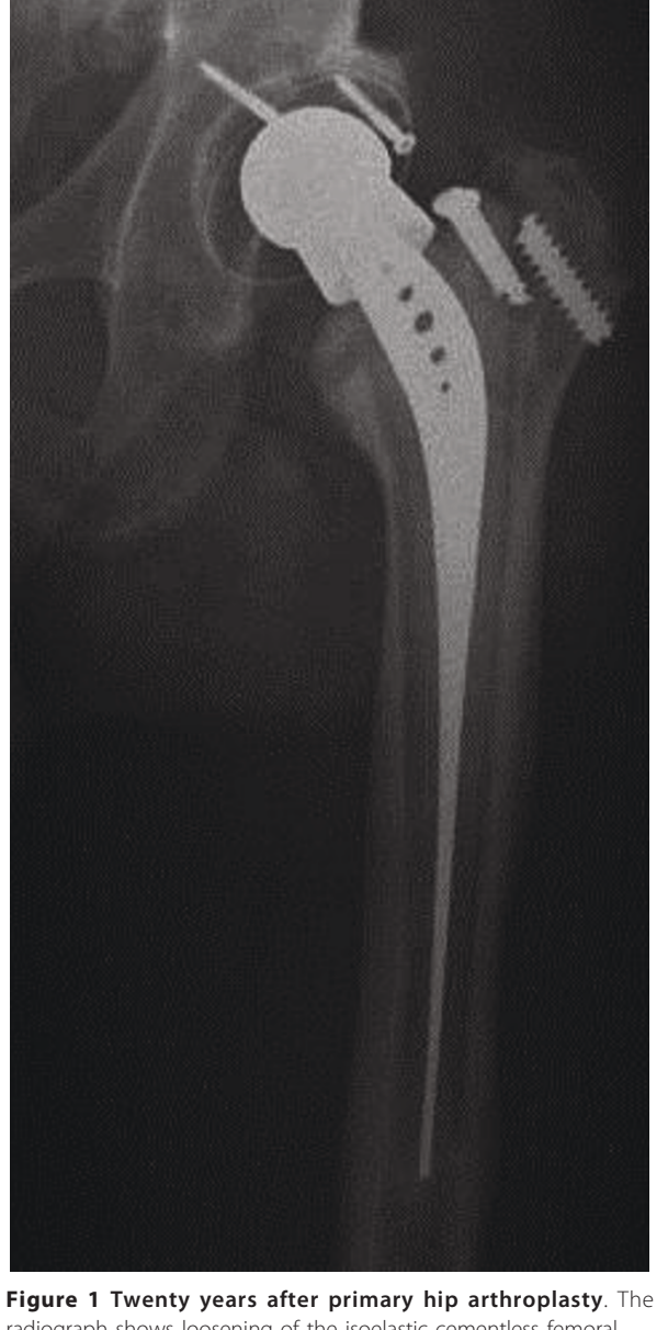
radiograph shows loosening of the isoelastic cementless femoral stem and well-fixed titanium-coated RM acetabular cup.

In this case, we used chisels to weak the superior part of the implant and to create a roughness surface for the reamer action. When the polyethylene was thin enough, it was removed easily by hand tools without the risks of